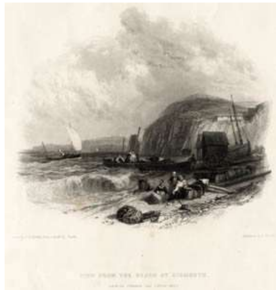
Image 1 SC2500, View from the Beach at Sidmouth, Edward Finden, 1842

The greater part of more valuable sorts of fishes, captured in the port of Plymouth, are sent, by coach, to London, Bristol, Bath and Exeter, namely Soles, Turbots, Sturgeons, Surmulletts, [sic] Salmons, &c. besides a portion of Pilchards, Herrings, and Mackarels [sic]. The Steamers convey large quantities of Hake and other fish, to Portsmouth weekly. The Trawlers themselves often convey quantities of Hake to Portsmouth, and, vessels are often sent across to Jersey, and other Channel Islands, with Mackarels, Herrings, Pilchards, &c. The French convey away a deal of our Congers, Hakes, Skates, Pilchards, Herrings, Mackarals, &c. periodically, besides maintaining with us a regular trade in Crabs, Lobsters, and Crayfish, giving on the average 6d. a piece for these; they purchase Mackarels partly for sale in their own country as food, and partly for 'salting in' as bait for the Cod in their Newfoundland fishery. Not only is the immediate neighbourhood supplied with fish from our fishery, but, a large supply is taken in carts to all the surrounding villages and towns, including Tavistock and Launceston, which receive a quantity two or three times per week. This dealing forms the support of a great many persons.