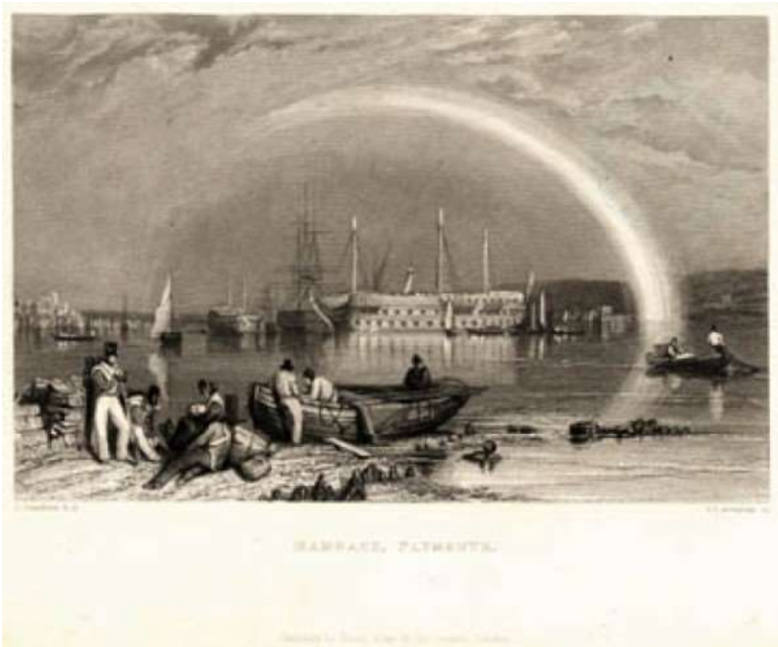
Image 5 SC1955, Hamoaze Plymouth, 1836

The trawlers are cutter or dandy-rigged, and their crew includes the skipper, three men and a boy. There are besides, forty or fifty dandy-rigged boats of smaller size engaged in hooking. These also however, when the pilchard shoals come close enough to the land, lay aside their long-lines and use drift-nets for the surface fish.