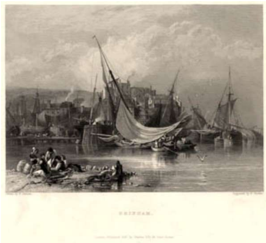
Image 3 SC0248, Brixham, Edward Finden, 1837

Brixham possesses the largest indigenous fishing-fleet on the South coast. There one hundred and fifty, more or less, of the large class of trawlers, smart craft of 30 to 40 tons; there are about half as many of the "mumble-bees," smaller boats of 15 to 25 tons; and there are twenty or so still smaller hookers. ... The number of men and boys employed at Brixham on the boats themselves must amount to close on a thousand. The apprentice, an obsolete institution at many of the larger centres, is still a feature of the industry at both Brixham and Plymouth.