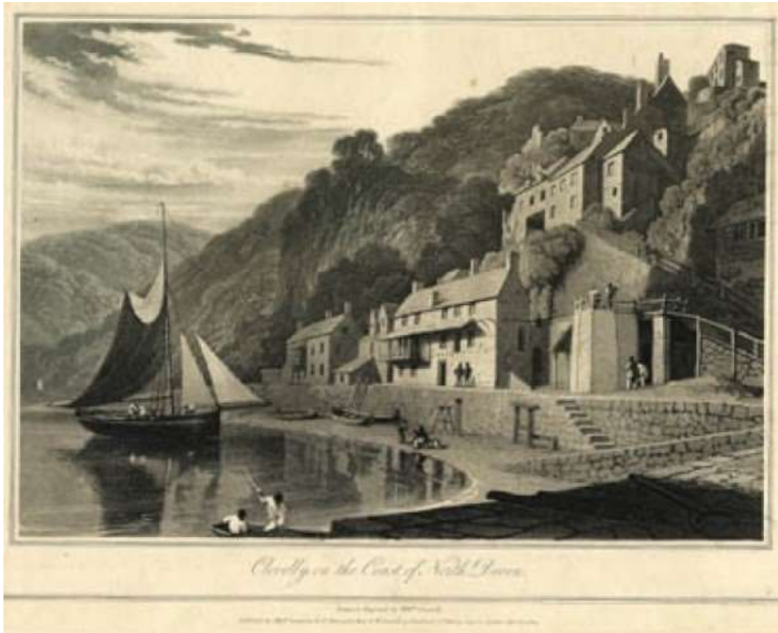
Image 9(a) SC0368, Clovelly on the Coast of North Devon, William Daniel, 1814