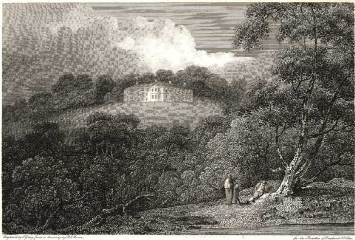
WOLFORD LODGE. Devonshire. The Seat of General Simcoe.