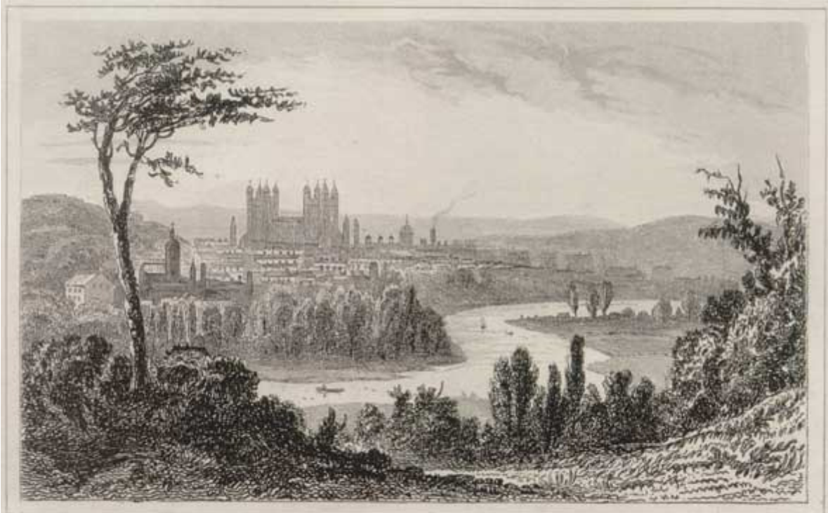
CITY OF EXETER, FROM EXWICK HILL.