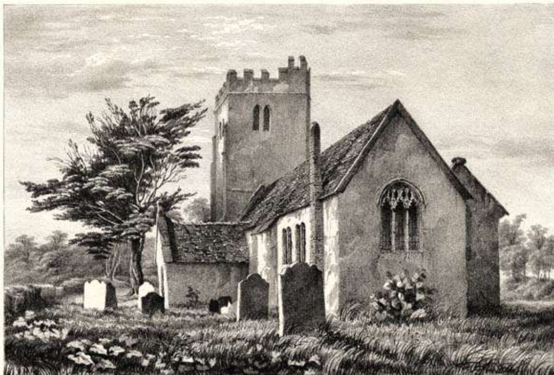
HOLCOMBE BURNELL CHURCH.