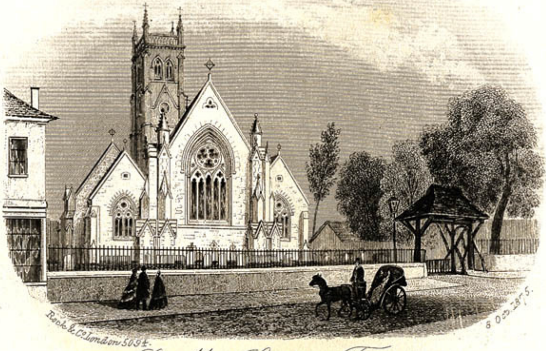
St. Mary Church, Torquay.